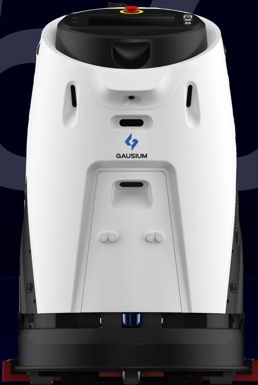
Scrubber 50 Pro / Sprayer AI-Powered Robotic Floor Scrubber